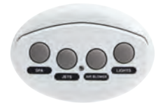
iS4 4-Function Spa-Side Remote