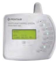
EasyTouch System Wireless Controller