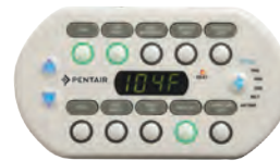
SpaCommand® Spa-Side Remote 10-Function Spa-Side Remote