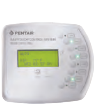
EasyTouch System Indoor Control Panel (4- or 8-Function Control)

EasyTouch systems are available for a separate spa, a separate pool, or a pool/spa combination with shared equipment. You select from systems that control four or eight accessory functions. Four-function systems are typically used to control pool and/or spa operation plus pool or spa lights and heaters. Eight-function systems allow separate scheduling for additional features, such as landscape lighting, waterfalls, fountains, additional heaters and more. Take the work and worry out of scheduling and operating pool and spa heating, filtration and cleaning cycles. For even greater convenience, you can add any of these optional controllers: