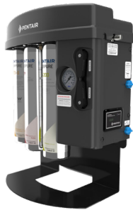
EZ-RO 200/16G-BL with optional floor stand bracket