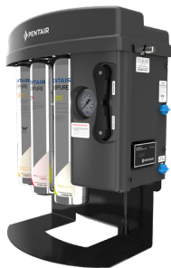
EZ-RO 375/5G-BL with optional floor stand bracket