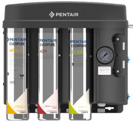
EZ-RO 375/10G-BL wall mount