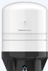
10-gallon hydropneumatic tank