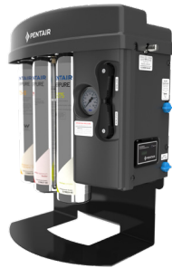
EZ-RO 375/16G-BL with optional floor stand bracket