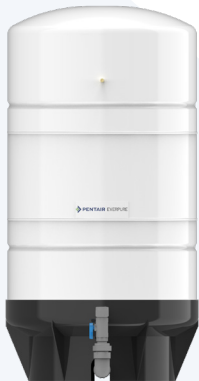
16-gallon hydropneumatic tank