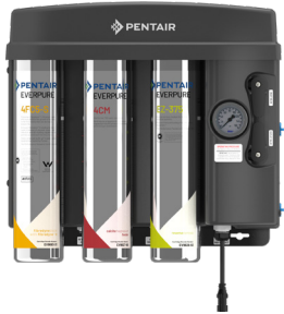
EZ-RO 375/50ATM wall mount