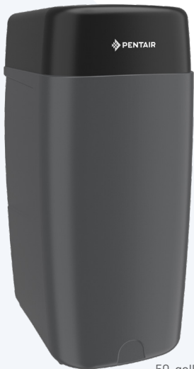
50-gallon atmospheric tank