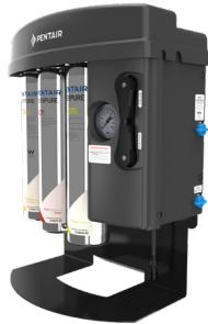
EZ-RO 375/50ATM with optional floor stand bracket