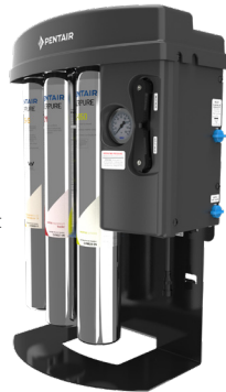
EZ-RO 650/50ATM with optional floor stand bracket